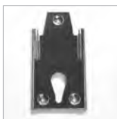
click-on wall mounting set